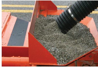
Gravity feed delivery