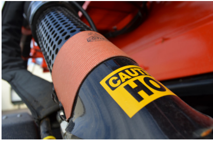
Vent-Flo nozzle with optional heater