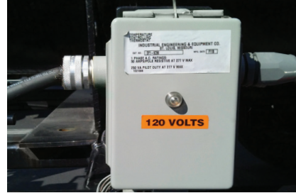
Overnight heating system