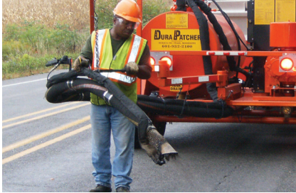
Ergonomic no-stress boom