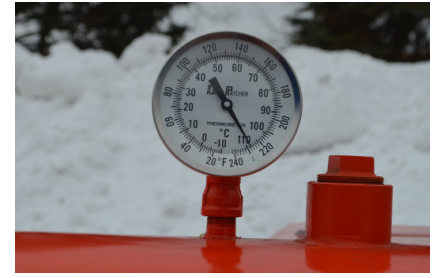
Large temperature gauge