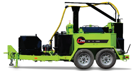
M-Series Crack Sealers